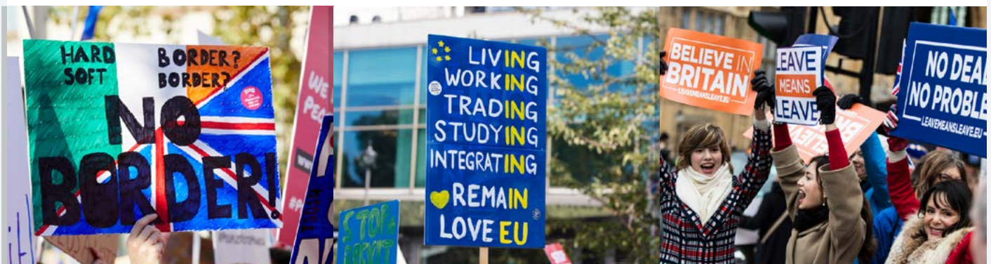
Brexit has divided public opinion in the UK and sparked fears about its impact on Northern Ireland.